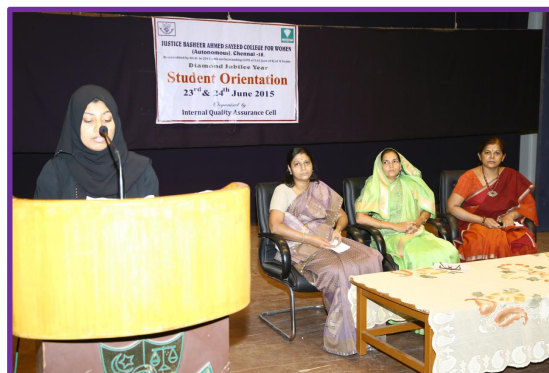
Invocation from the Holy Quran