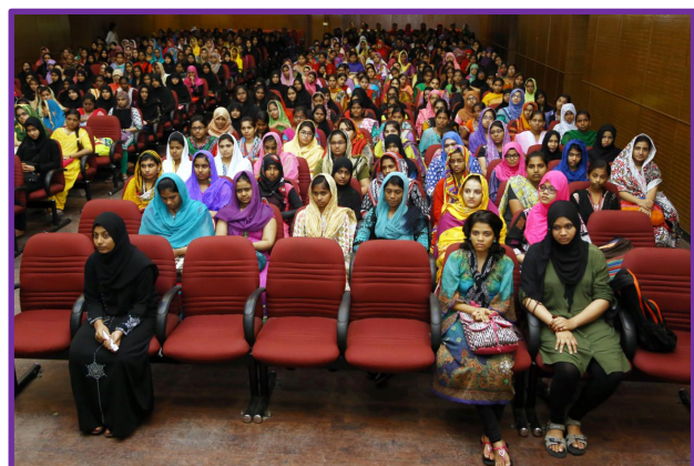
First year students enjoying the orientation programme